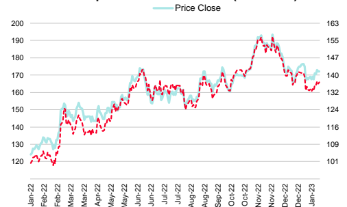
PTT Exploration & Production (PTTEP TB)