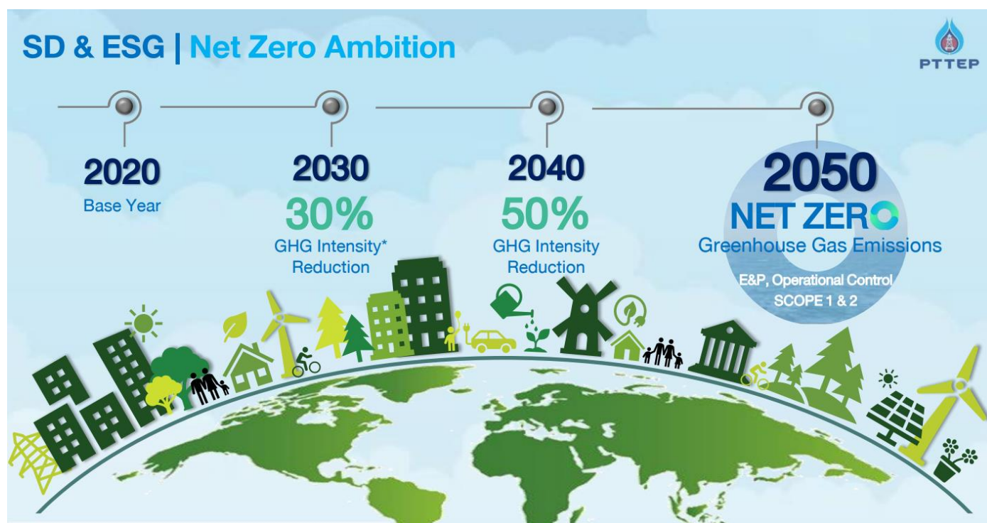
Figure 2: PTTEP is moving towards net zero emissions by 2050